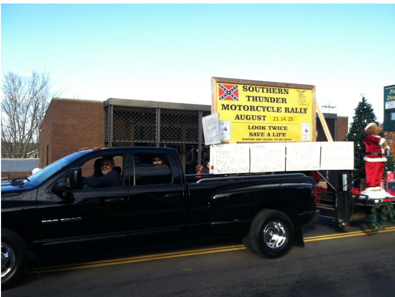
Robertson County Christmas Parade

Julius Caesar established Jan. 1 as the first day of the year in 46 B.C. He did this partly to honor the month's namesake, Janus, the Roman god of beginnings. Christian leaders in medieval Europe replaced Jan. 1 as the first day of the year with days carrying more religious significance, such as Dec. 25, which is the anniversary of Jesus' birth. In 1582, Pope Gregory XIII reestablished