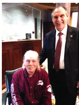
CMT/ABATE Volunteer Freedom Fighters visit Tennessee State Capitol

Note: State Board Meetings are the second Sunday of March, June, September, and December