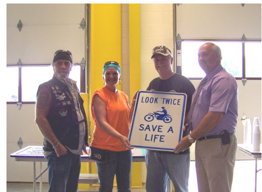
Watertown Sign Presentation