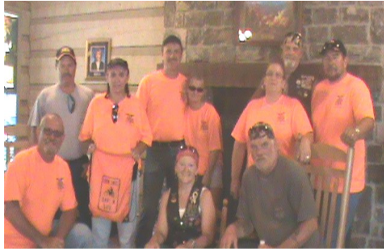
Smith Wilson Litter Bag Run to Buffalo Valley Welcome Center