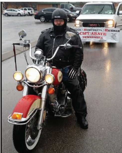
D/H/H CMT/ ABATE represent- ing at Dickson Christmas Parade.