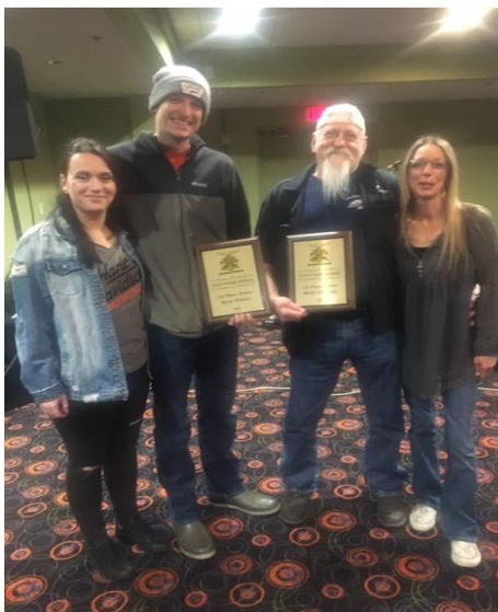
1 st place winners